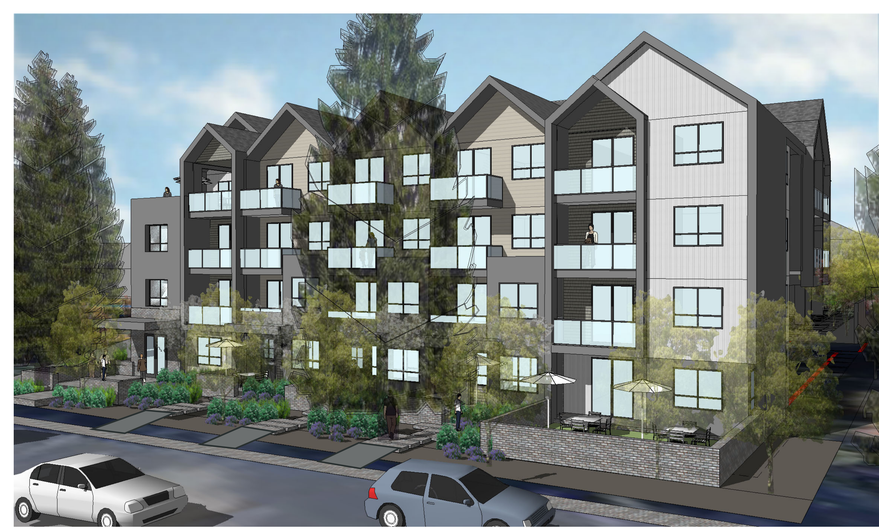
VIEW FROM DEPARTURE BAY ROAD