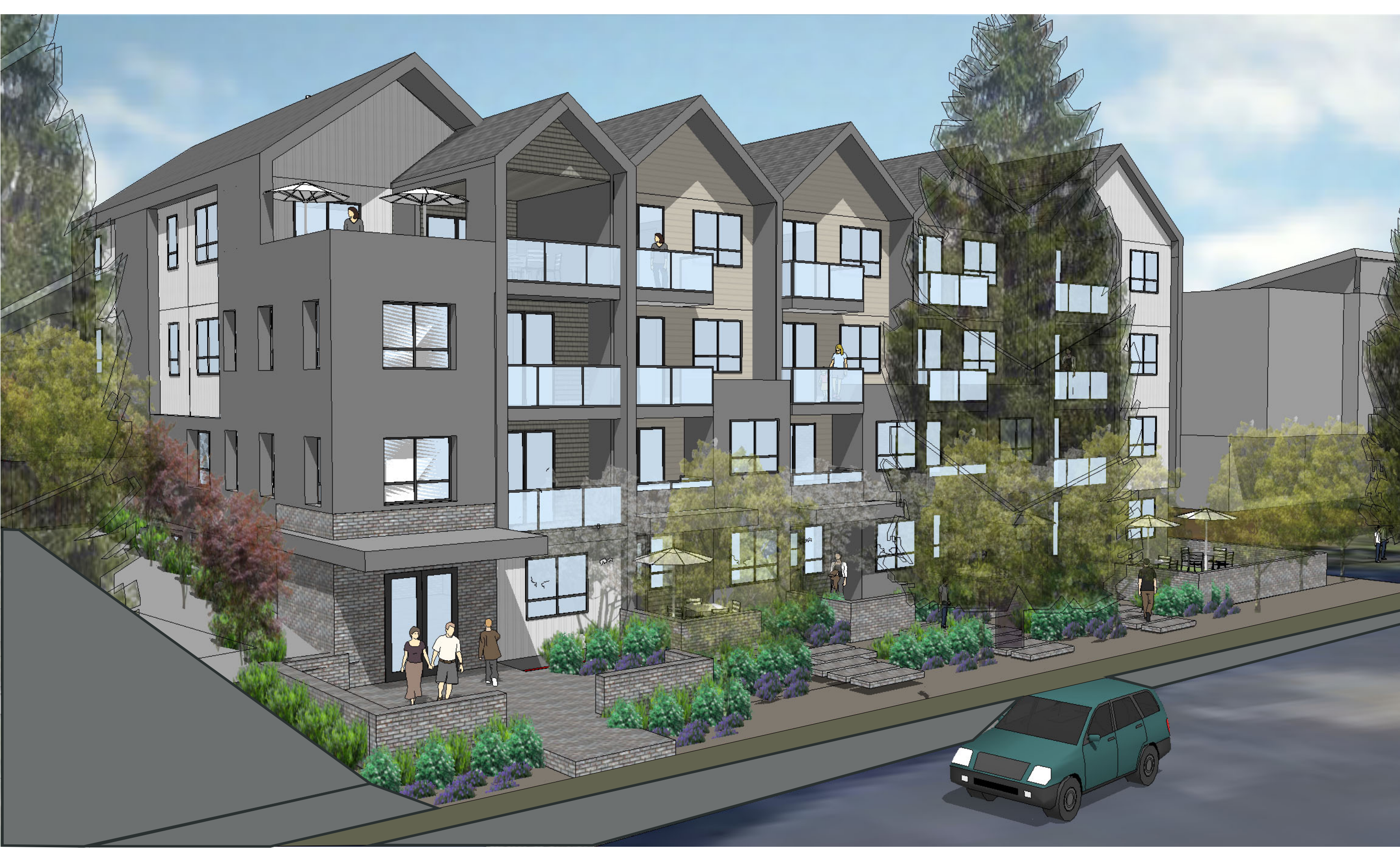
VIEW FROM DEPARTURE BAY ROAD