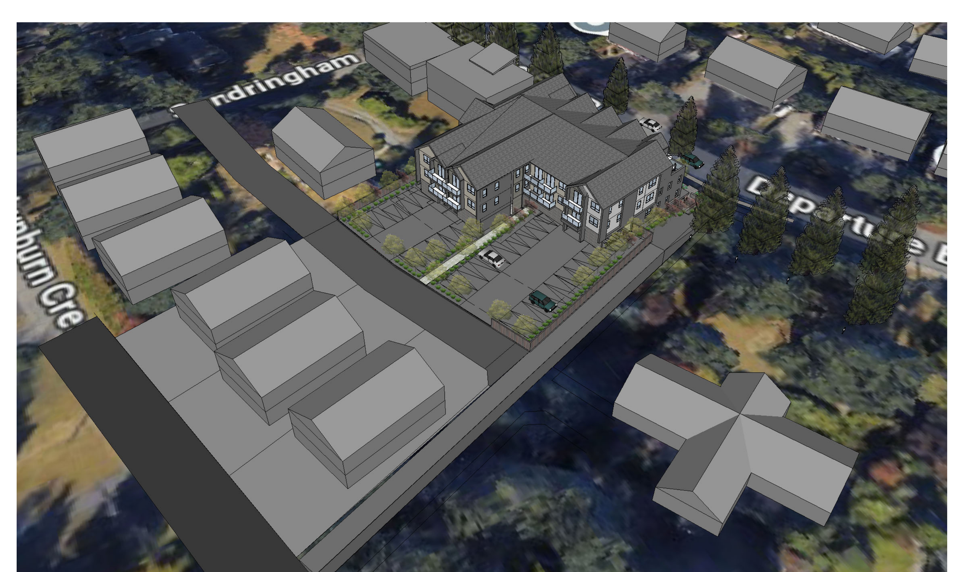
TOP REAR VIEW