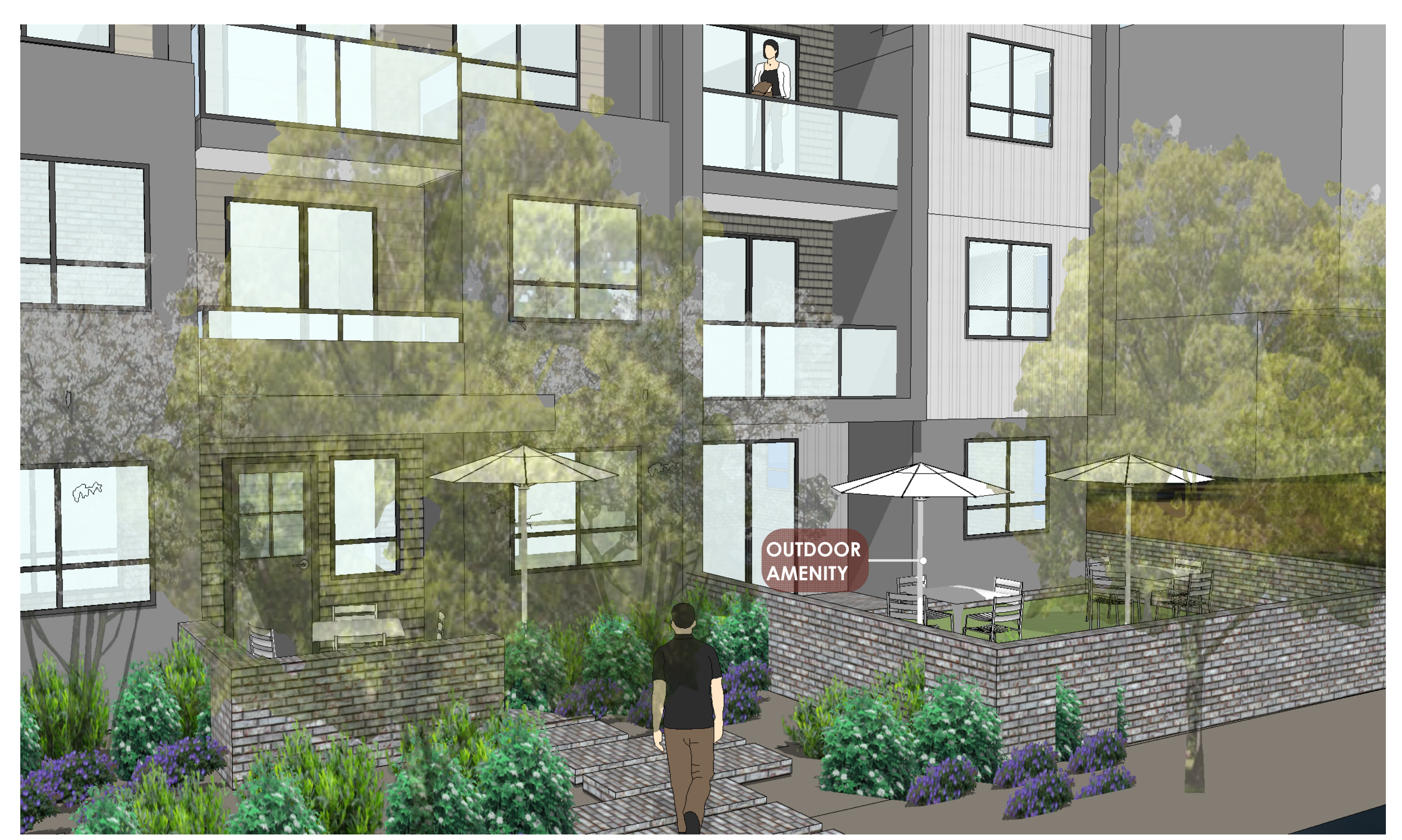
OUTDOOR AMENITY CONNECTED TO FITNESS ROOM AMENITY ON LEVEL 1