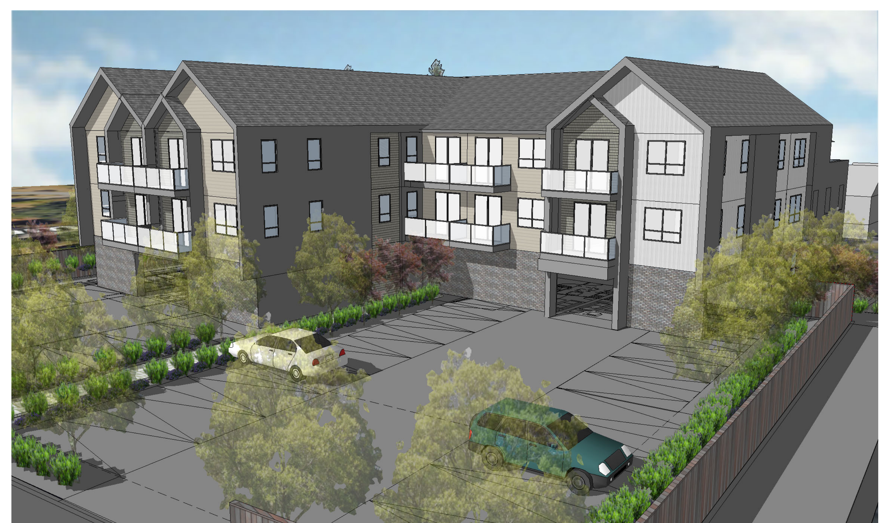
VIEW FROM DRIVE LANE AND PARKING AREA