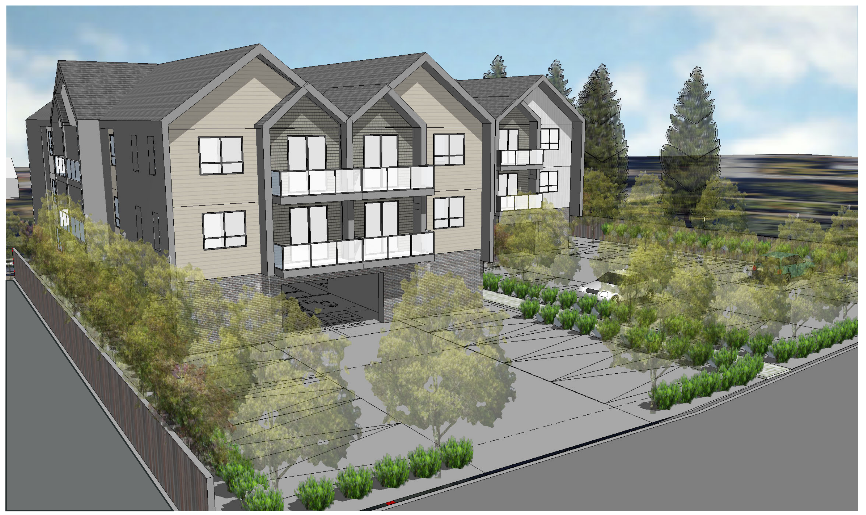
VIEW FROM DRIVE LANE AND PARKING AREA