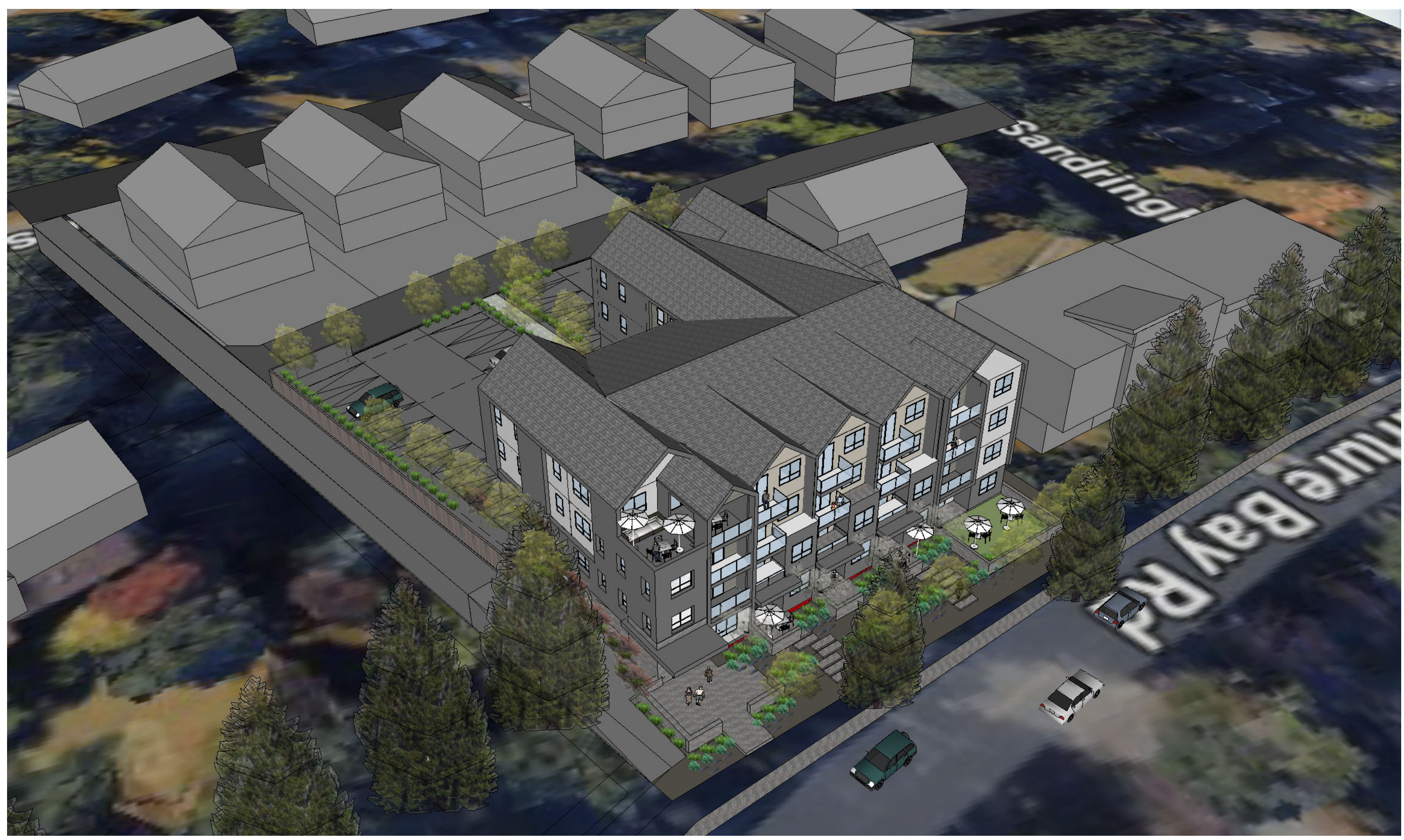
TOP FRONT VIEW