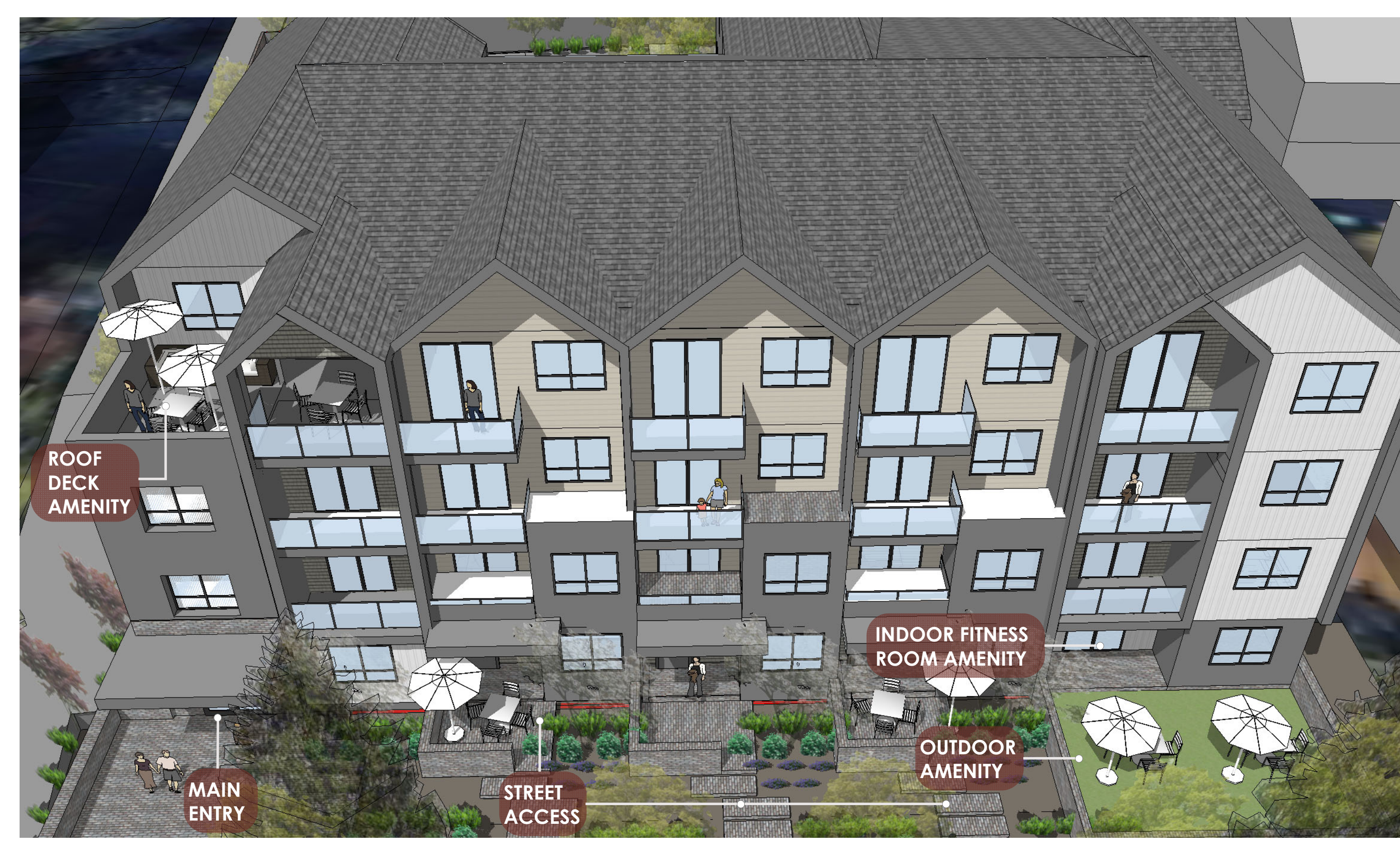
VIEW FROM DEPARTURE BAY ROAD