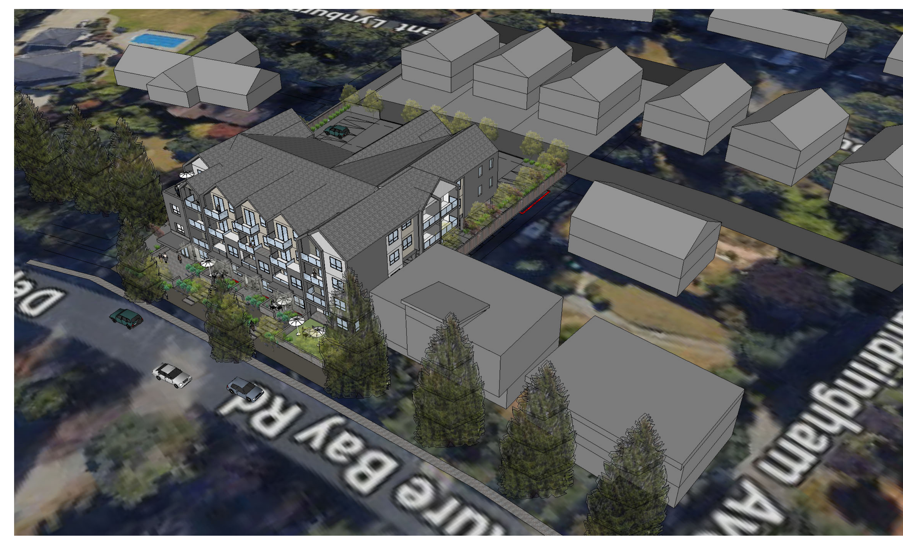
TOP FRONT VIEW